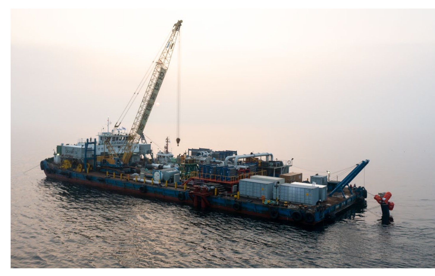
1MW OTEC Riser Installation at Pohang

KRISO has led research and development on OTEC since 2010 and built a 20 kW OTEC pilot plant. How important was the research with this plant for the design of the 1 MW OTEC Kiribati plant? Which important lessons learned you could mention?