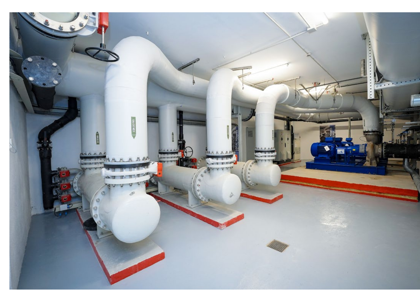
MKA-Boucle Thalasso Thermique

It's more than 7000 housing which will be able to benefit from this carbon neutral thermal energy, by 2025, avoiding, therefore, more than 10 \text{ ktCO}_{2eg} every year.