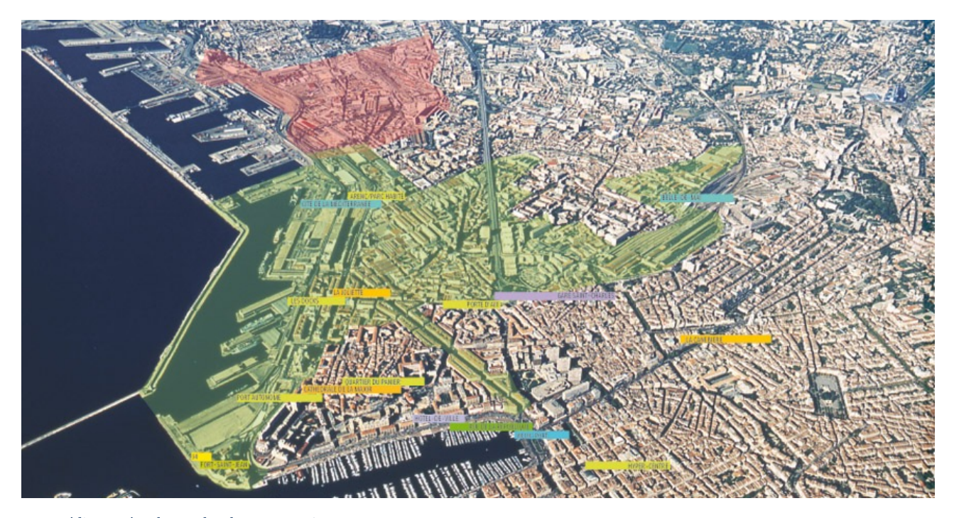
Euroméditerranée urban redevelopment project