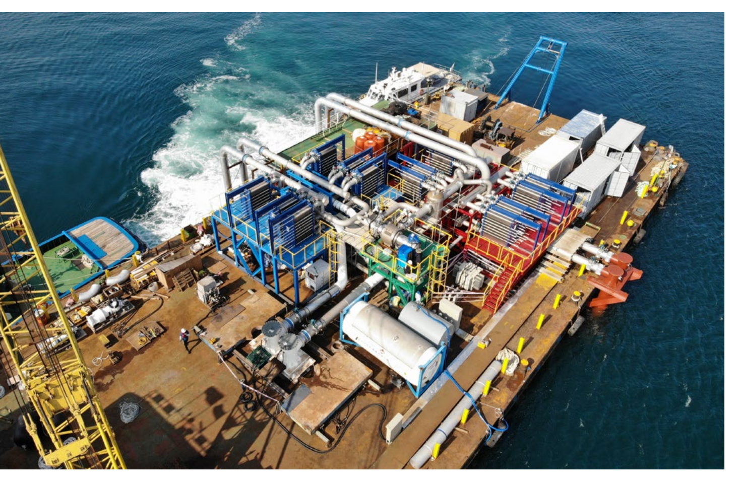
1MW OTEC operation at Pohang

Lessons learned from pilot experiment are specifications of the key components (heat exchanger, turbine, etc.) to fill the gap between the theoretical modelling and the actual system, stabilization of initial and emergency operation, potential methods to reduce parasitic losses and so on.